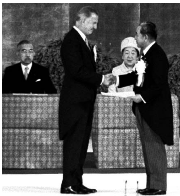
Reversion of Okinawa Ceremony, Tokyo, May 15, 1972

As part of the revised bilateral security treaty, signed in January 1960 and going into effect in June that year, as well as the related Status of Forces Agreement (which also went into effect at