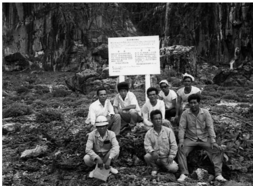
The Installment of the No-trespassing Sign

On a slightly related note, in the late 1960s, after Taiwanese fishermen had illegally landed in the Senkakus, the Government of the Ryukyu Islands put up “no trespassing” signs at the suggestion of USCAR. (Denying access to areas is an important aspect to show ownership of land or property, and an important concept in real estate.) These signs were finally installed in July 1970, including on Kuba Island and Taishō Island. 23